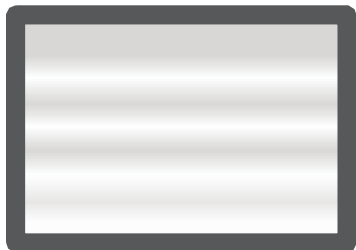
Fluorescent T8 Shadows and Striping