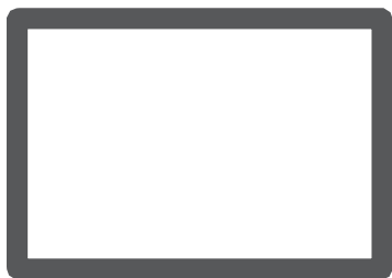
Tetra®EdgeStrip Even Illumination